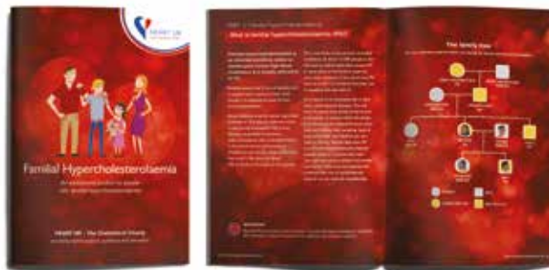
Other HEART UK leaflets: